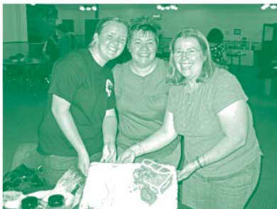
Cake decorating contest at Hartland's Women's Retreat.